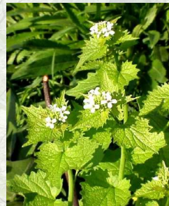
Garlic Mustard - Invasive